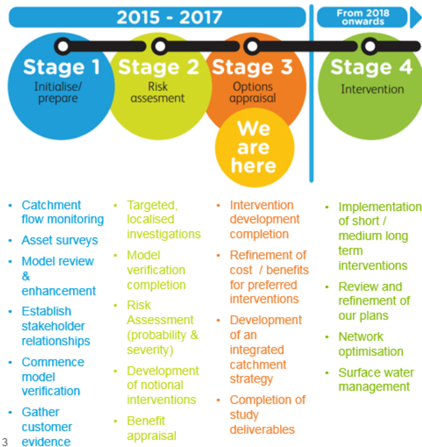
Figure 1: Project Timeline and Tasks

Figure 1 explains the work undertaken to date, the stage we are currently at in the process and future plans for the project.