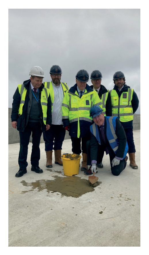
Council Plan 2023 to 2026