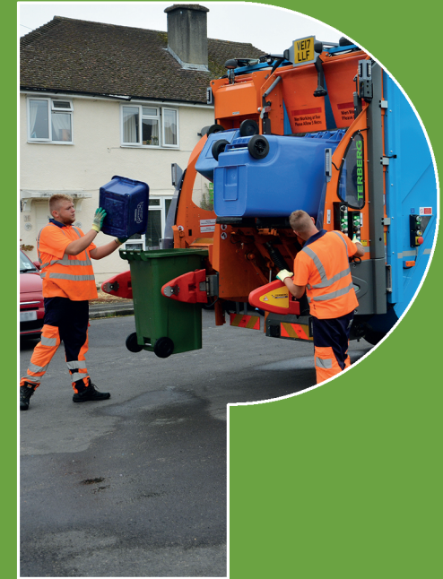
Better Public Services